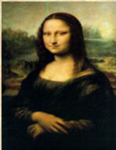
wPĭ Kgĕ. tgvbvij mv (1503-1506)